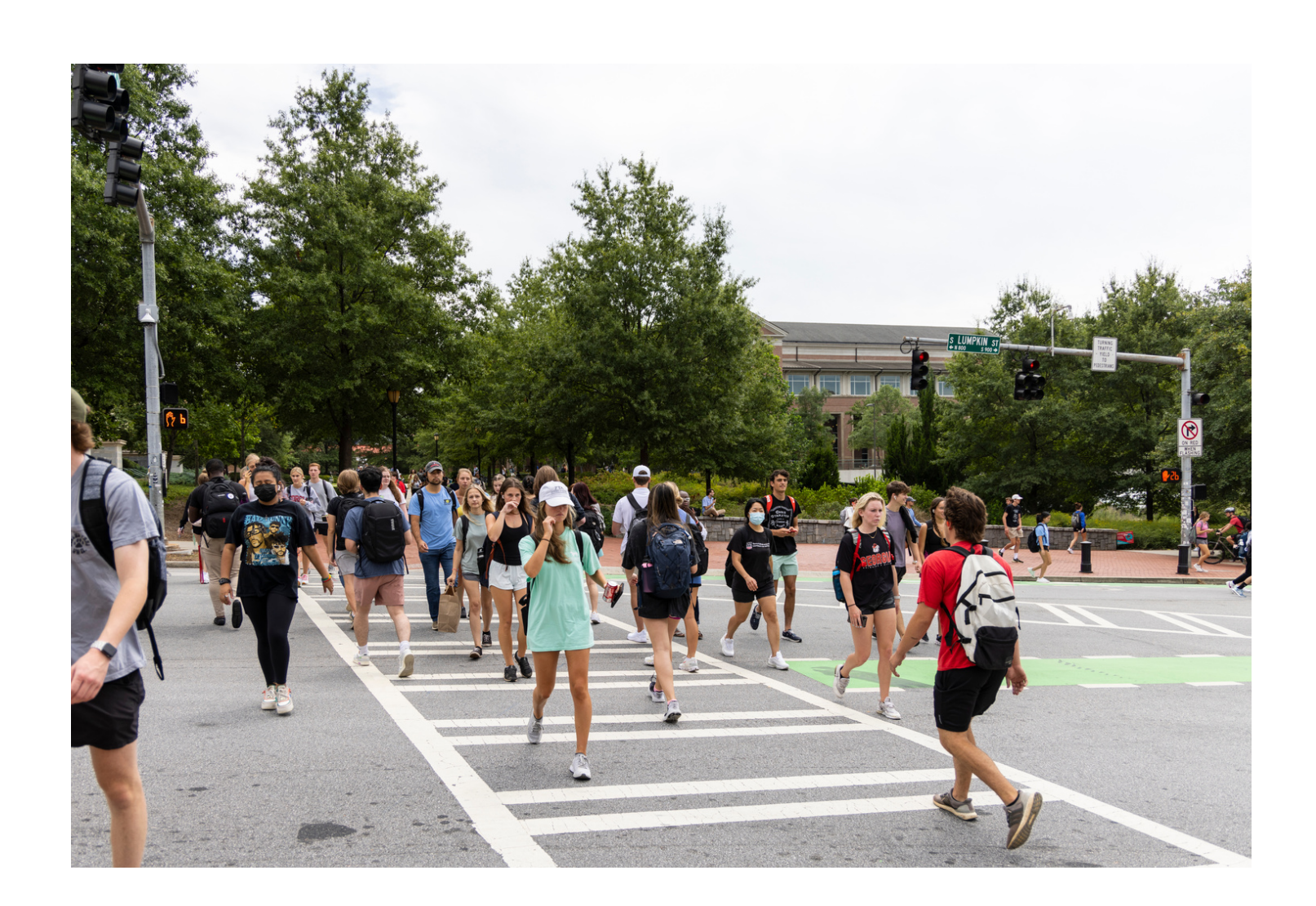
Ride where you can be seen, not on sidewalks.

As a community, we need to look out for each other.